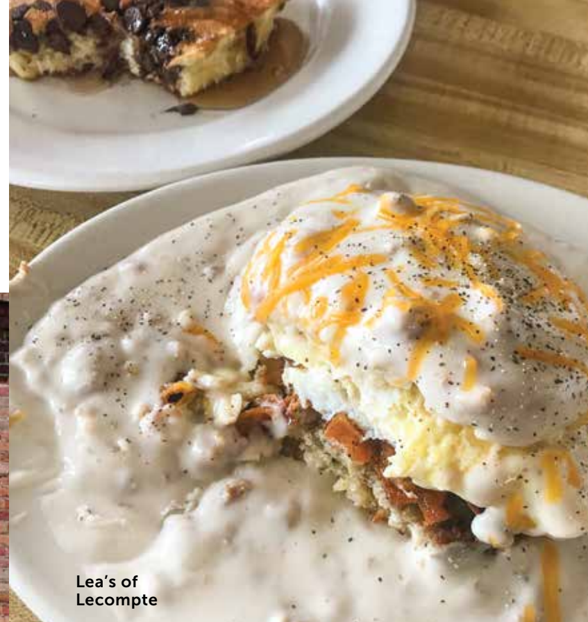
Lea's of Lecompte

TUCKED AWAY IN NORTHERN LOUISIANA and seated on the banks of the Ouachita River and Bayou Desiard is a delightful duo of cities rich with history and connection: Monroe-West Monroe. Many years ago, this area blossomed due to its distinct role in the industrial and commercial sectors. Nowadays, the area is often referred to as “twin cities,” generously dotted with memorable restaurants, local goods and antiques stores, a vibrant community, and, quite simply, more than meets the eye.