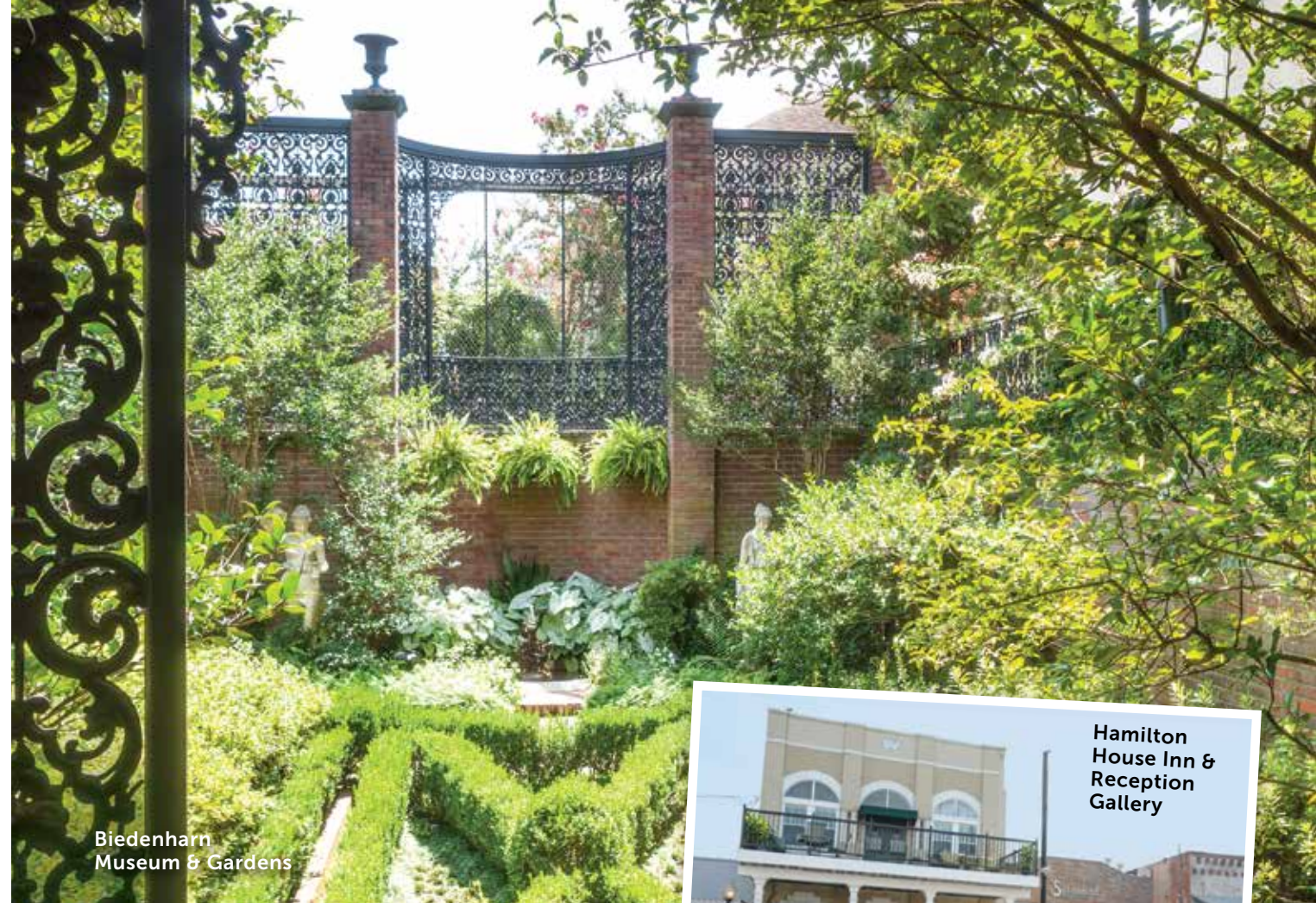
Biedenharn Museum & Gardens