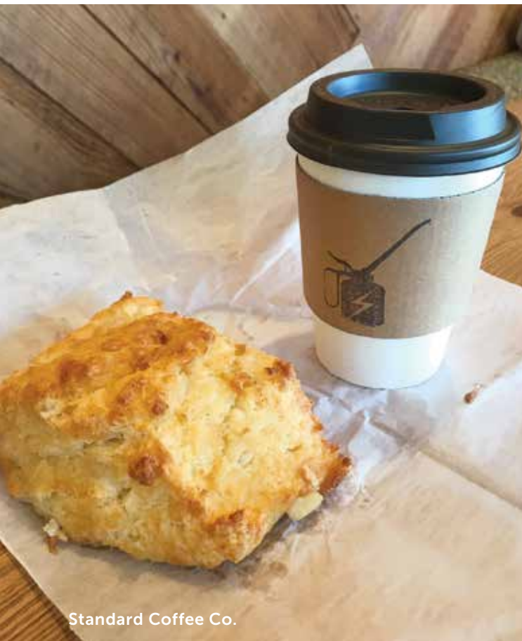
Standard Coffee Co.