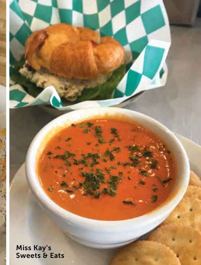
Miss Kay's Sweets & Eats