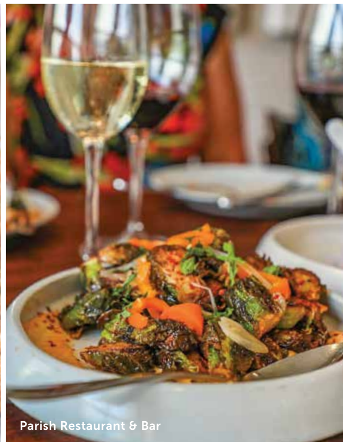
Parish Restaurant & Bar