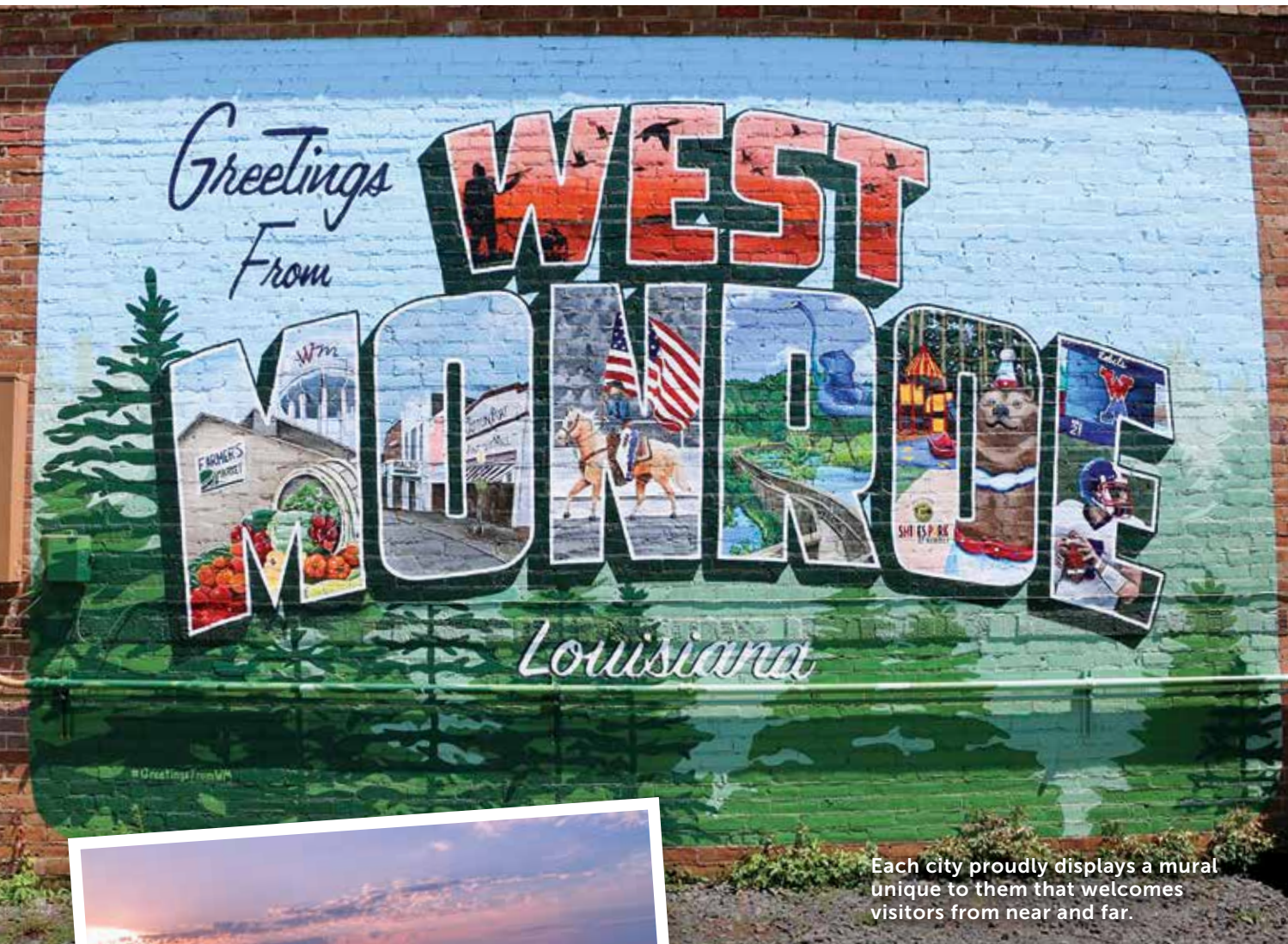
Each city proudly displays a mural unique to them that welcomes visitors from near and far.